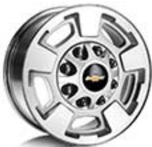
PYQ Wheels, 17" (43.2 cm) machined aluminum